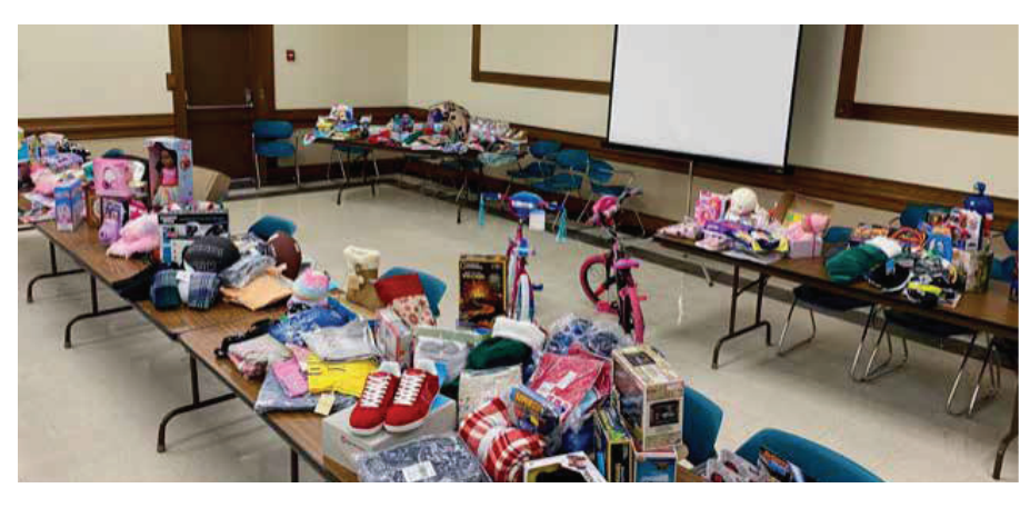
At C & L, our mission is to keep houses warm and hearts warm too!

To spread Christmas cheer, employees of C & L Electric Cooperative adopted six families to make their holidays merry and bright. Our employees not only sold raffle tickets to raise money, they shopped and assembled gift baskets — all so that 16 children could experience comfort and joy at Christmas.